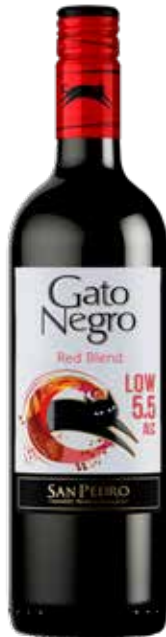
Low Red Blend